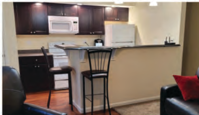
1221 N. Logan Ave/3816 Sonny Ln.