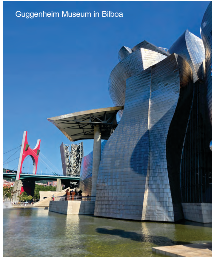
Guggenheim Museum in Bilbao

dangerous treks across a continent. It gives you a fresh perspective on the small segment in time that we are here and that we get to call our own. It makes you realize we are a blimp in the history and expanse of humanity that has come before us and will follow our small adventure. The best part of Bilbao though, and the thing that resonated with me being from Vermilion County and representing Danville, was Bilbao's rebirth from the 1990's to the present day. Bilbao was once known as the "Pittsburg of Spain". Its number one industry was the steel industry. Due to macro level economic factors in the 1970's and 1980's the steel industry died and left Bilbao, leaving a troubled and distressed city. In the 1990's, the decision was made to reinvent themselves. The city invested serious money in recreating the river front district, building the historic Guggenheim Museum, an art museum that to this day is the largest titanium building in the world. Walking along the waterfront past the huge museum or through the retail district in the old City Center and past the old historic opera