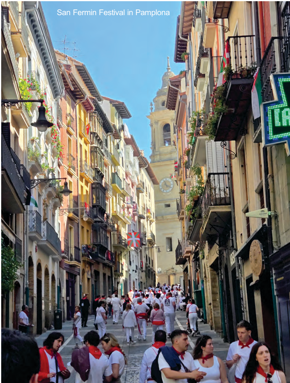
San Fermin Festival in Pamplona

The first stop at Viscofan was to their production facility in Cáseda, Navarra. It is a massive facility where they produce meat casing for both the European and American markets. They had on hand a chef that specialized in sausage preparation and we were able to sample some products prior to receiving a presentation on worldwide business and that specific plant. After an informative presentation and a discussion about the company and that facility, we were able to tour the plant where Viscofan manufactures meat casings made of fibrous, plastic, cellulose and collagen for customers around the world. We viewed extensive improvements in the plant to increase energy efficiency and to improve water quality. The stated goal is to make that facility net neutral with its carbon