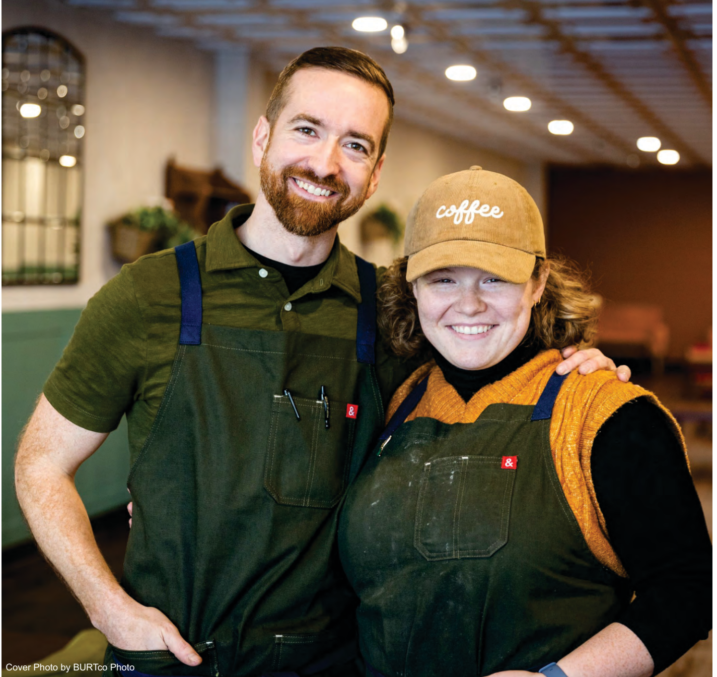
Cover Photo by BURToo Photo