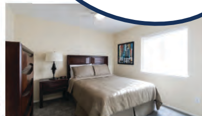
9 Ridgeview St.

Experience the Heartland Difference. Contact us today to find your ideal rental!