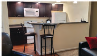
1221 N. Logan Ave/3816 Sonny Ln.