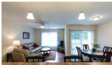
2200 N. Vermilion St.