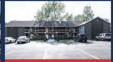
3816 Sonny Lane (North Danville)