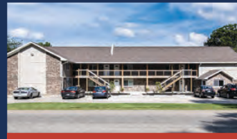
1221 N. Logan (North Medical District)