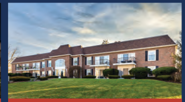
1618 N. Vermilion (North Danville)