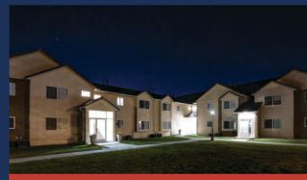
9 Ridgeview (North Danville)