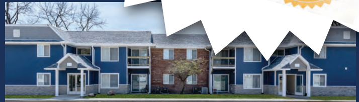
SUNSET COVE 2200 N. Vermilion (North Danville)

Other Time With Appointments - Call for an after hour appointment