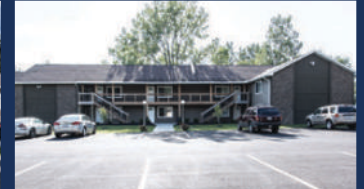
3816 Sonny Lane (North Danville)