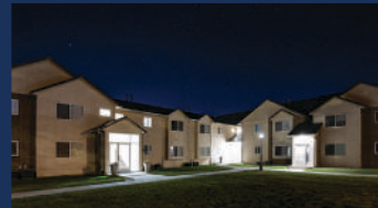
9 Ridgeview (North Danville)