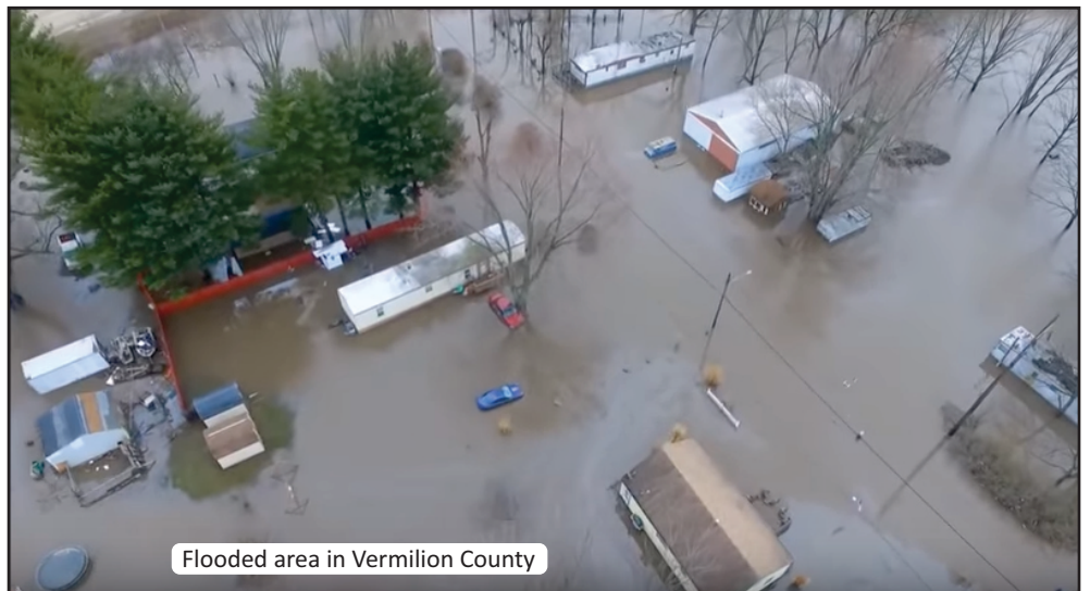
Flooded area in Vermilion County

Vermilion County Emergency Management can be found on Facebook and X (formerly Twitter).