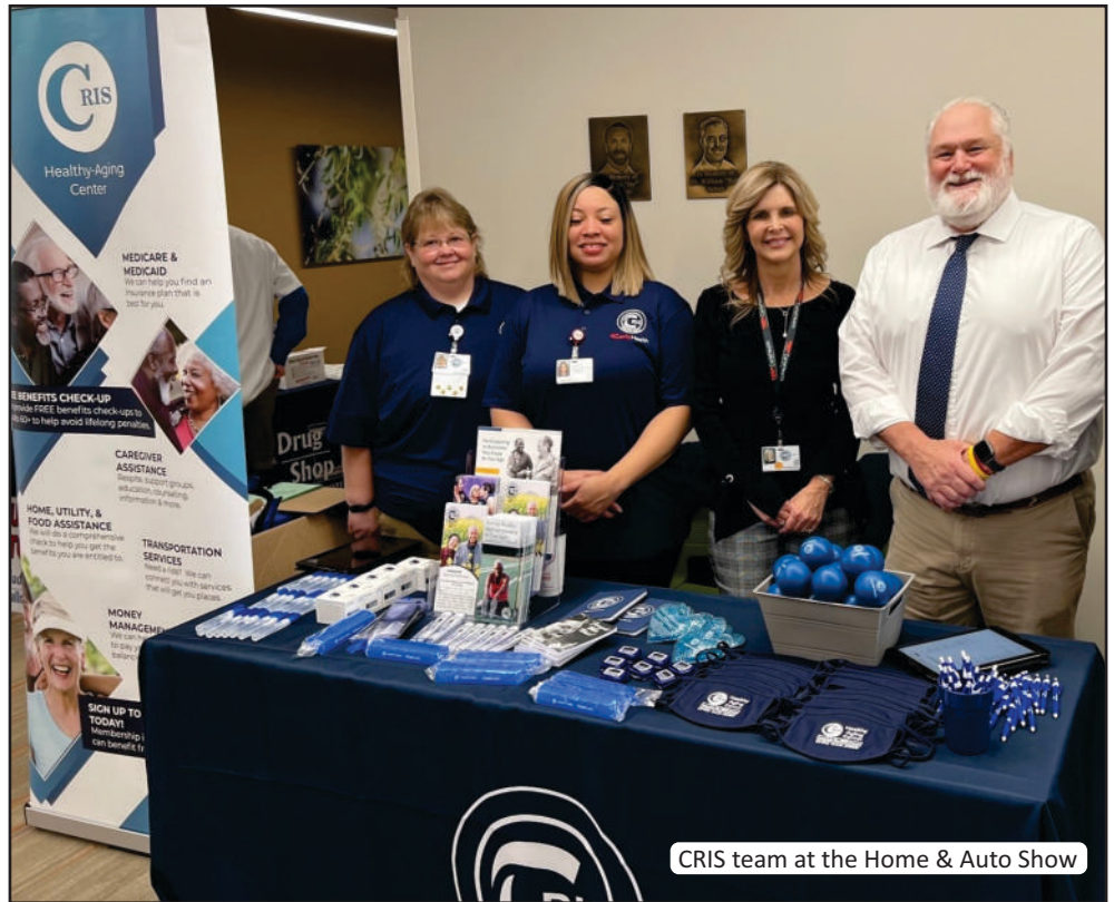
CRIS team at the Home & Auto Show

I am inspired to work with the 60-plus population because I was raised by my paternal grandparents and Dad. I have