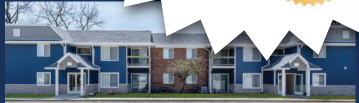
SUNSET COVE 2200 N. Vermilion (North Danville)

Other Time With Appointments - Call for an after hour appointment