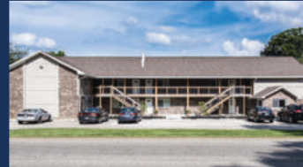
1221 N. Logan (North Medical District)