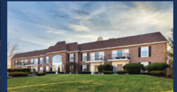
1618 N. Vermilion (North Danville)