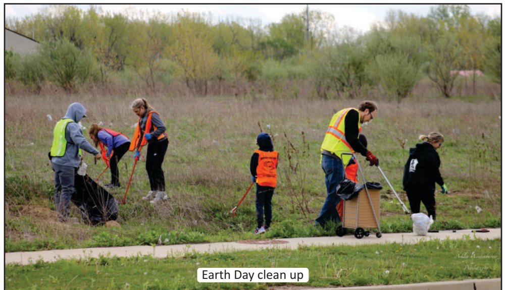
Earth Day clean up

For more information about Tilton, visit tiltonil.com , stop by the village office at 1001 Tilton Road, Tilton, IL 61833 or call (217) 477-0800. More about the community can also be found on Facebook, Twitter and YouTube.