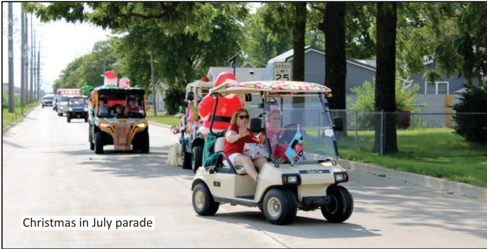
Christmas in July parade