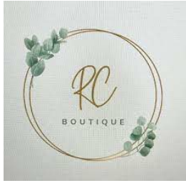
Rustic Charm/RC Boutique - Georgetown