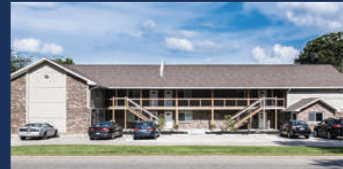
1221 N. Logan (North Medical District)