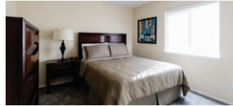
Extended Stay Rentals www.HeartlandPropertiesInc.net