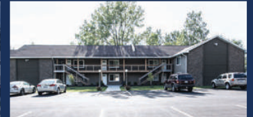
3816 Sonny Lane (North Danville)