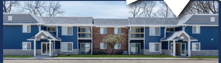
SUNSET COVE 2200 N. Vermilion (North Danville)

Other Time With Appointments - Call for an after hour appointment