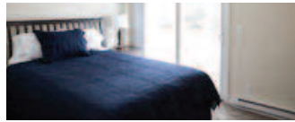
Extended Stay Rentals www.HeartlandPropertiesInc.net