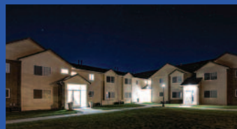
9 Ridgeview (North Danville)