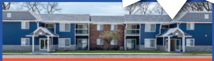
SUNSET COVE 2200 N. Vermilion (North Danville)

Other Time With Appointments - Call for an after hour appointment