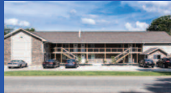
1221 N. Logan (North Medical District)