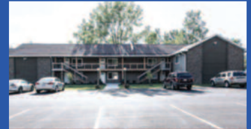
3816 Sonny Lane (North Danville)