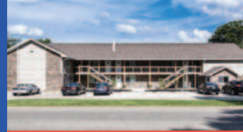
1221 N. Logan (North Medical District)