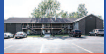
3816 Sonny Lane (North Danville)