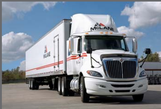
McLane Midwest Company, Inc. www.mclaneco.com

As a leading provider of grocery and foodservice supply chain solutions, McLane buys, sells, and delivers more than 40,000 consumer products – including foods, beverages, household items, automotive products and more- to thousands of retail locations across the U.S., including such familiar places as Wal-Mart, Target, CVS, 7-Eleven, Chevron-Texaco, Pizza Hut, Taco Bell and Circle K. The McLane Midwest Grocery division opened in Danville in 1993 and employs 700+ teammates who are committed to doing whatever it takes to make our customers successful. McLane is dedicated to living, working and investing to improve the communities we serve.