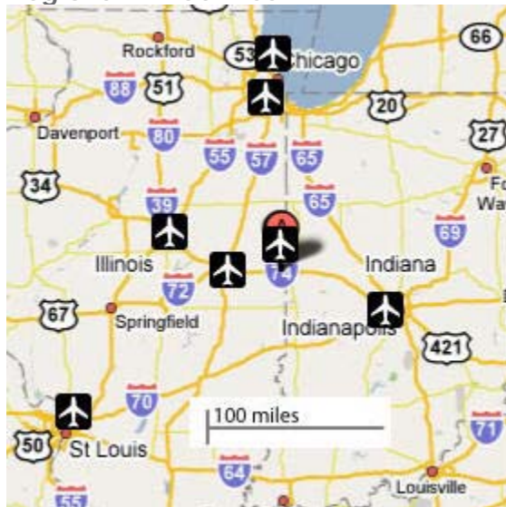
Base map provided by Google .