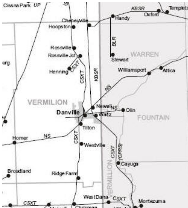
Source: Illinois Department of Transportation (Head to http://www.dot.state.il.us/officialrailmap.pdf for full map of Illinois in PDF format)